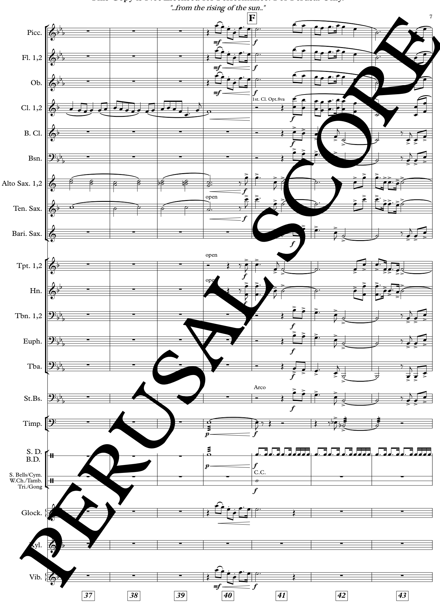
This Copy is Not Licensed for Performance. For Perusal Only.