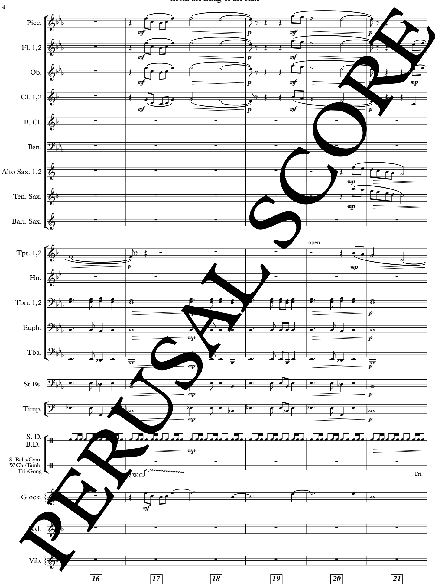
This Copy is Not Licensed for Performance. For Perusal Only. "...from the rising of the sun.."