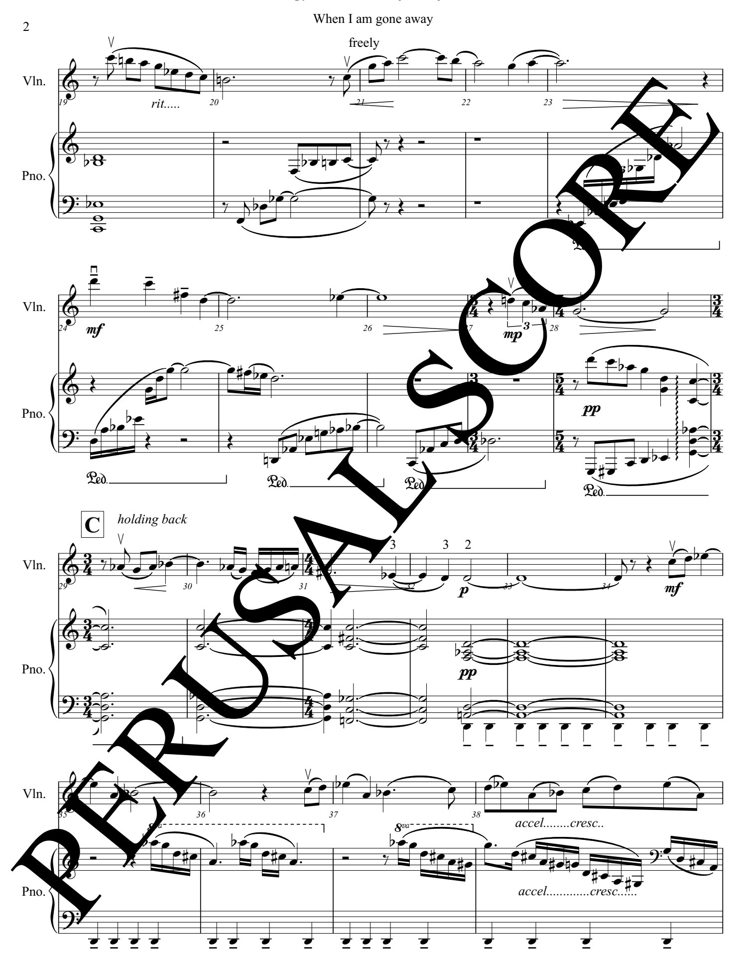
This Copy is Not Licensed for Performance