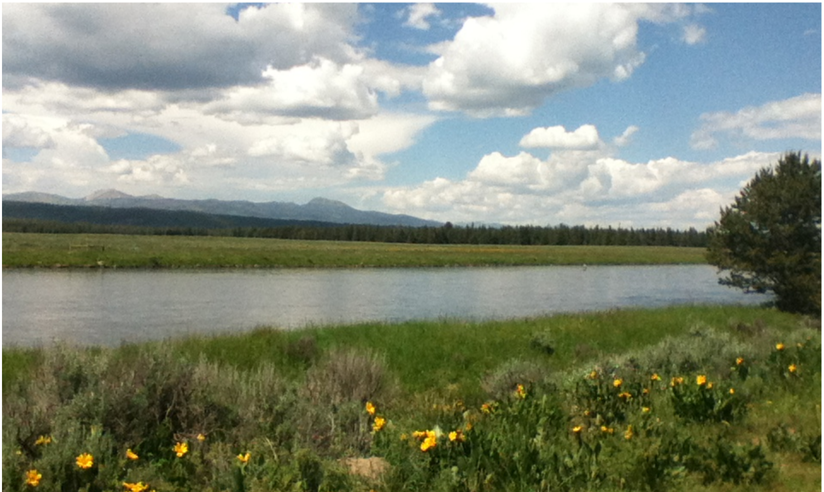
Madison River, West Yellowstone, Wyoming