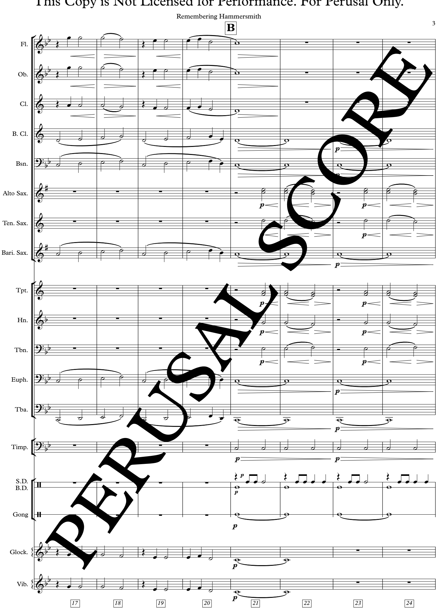
This Copy is Not Licensed for Performance. For Perusal Only.