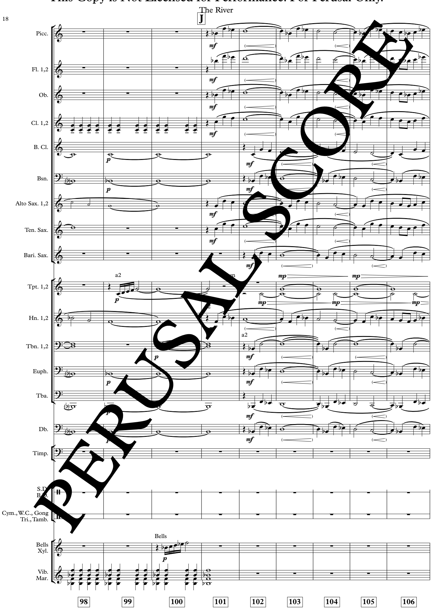
This Copy is Not Licensed for Performance. For Perusal Only.