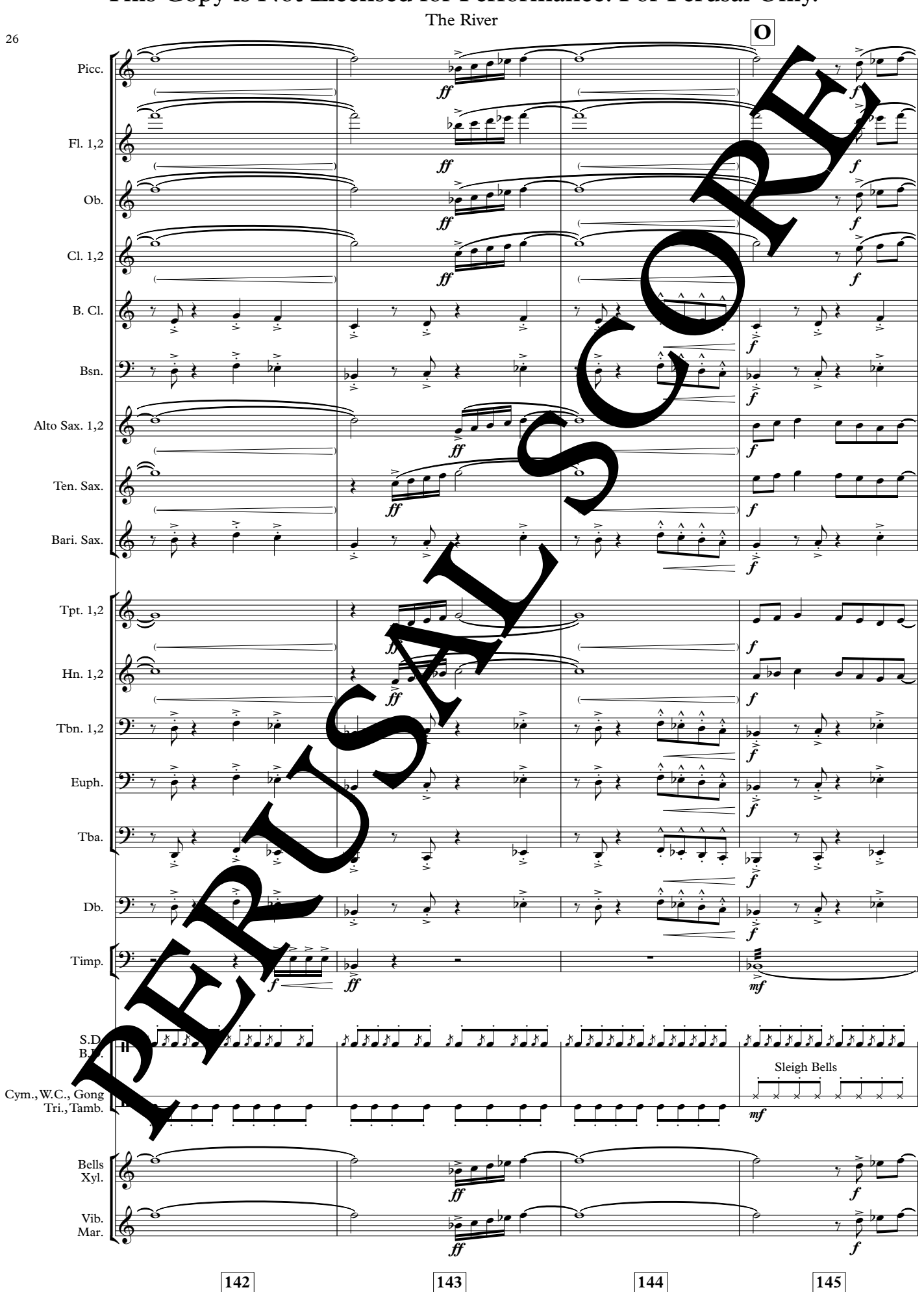
This Copy is Not Licensed for Performance. For Perusal Only.