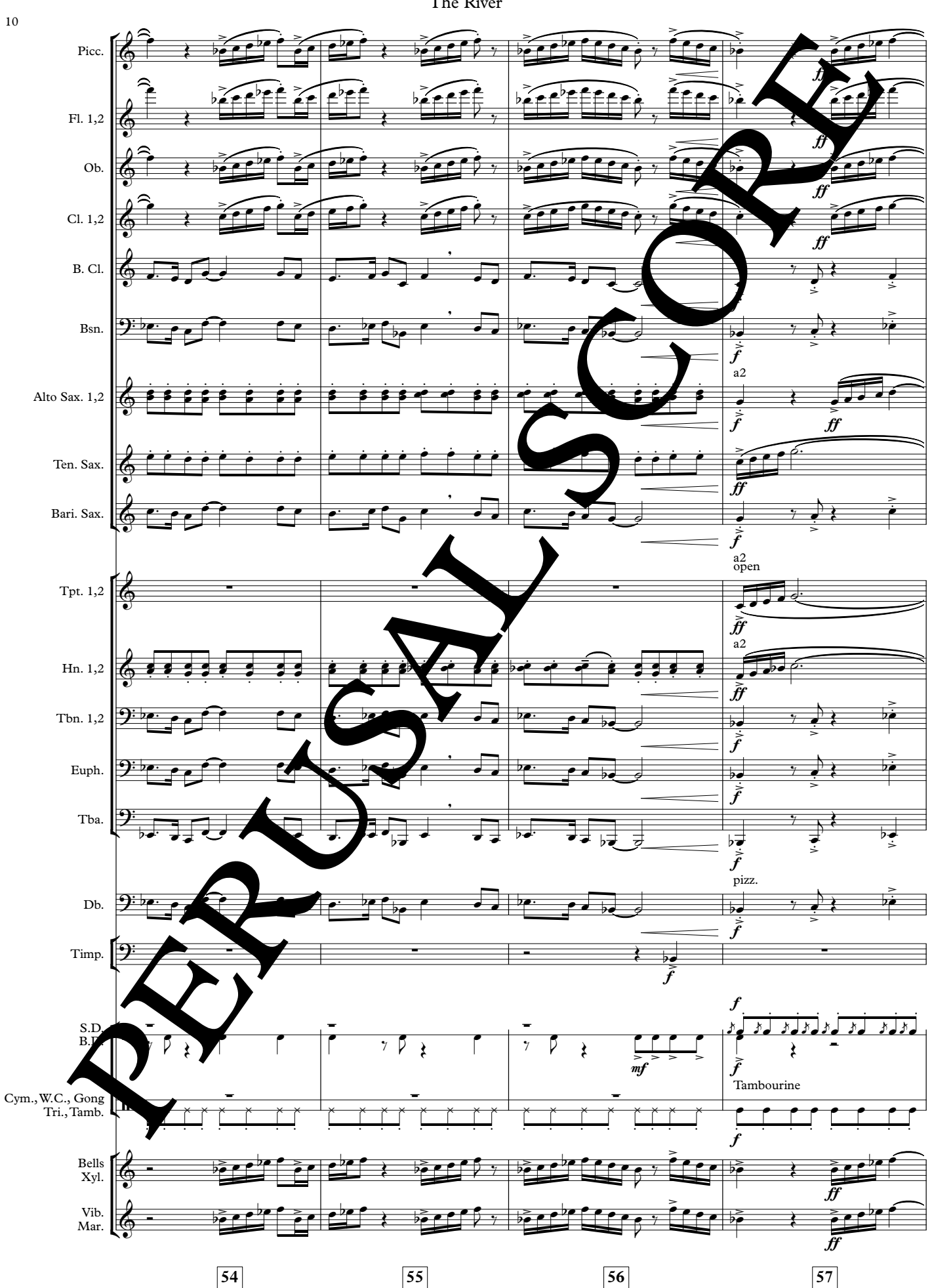
This Copy is Not Licensed for Performance. For Perusal Only. The River