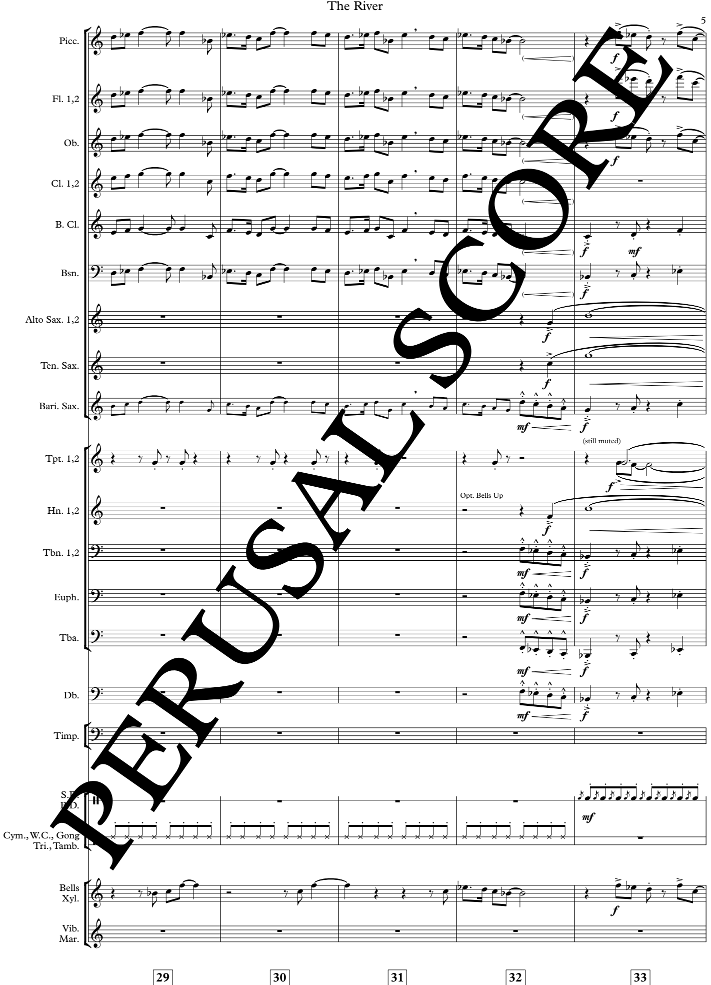
This Copy is Not Licensed for Performance. For Perusal Only. The River