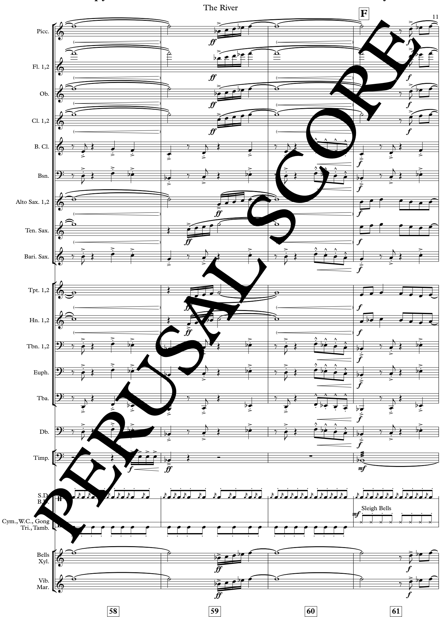
This Copy is Not Licensed for Performance. For Perusal Only.