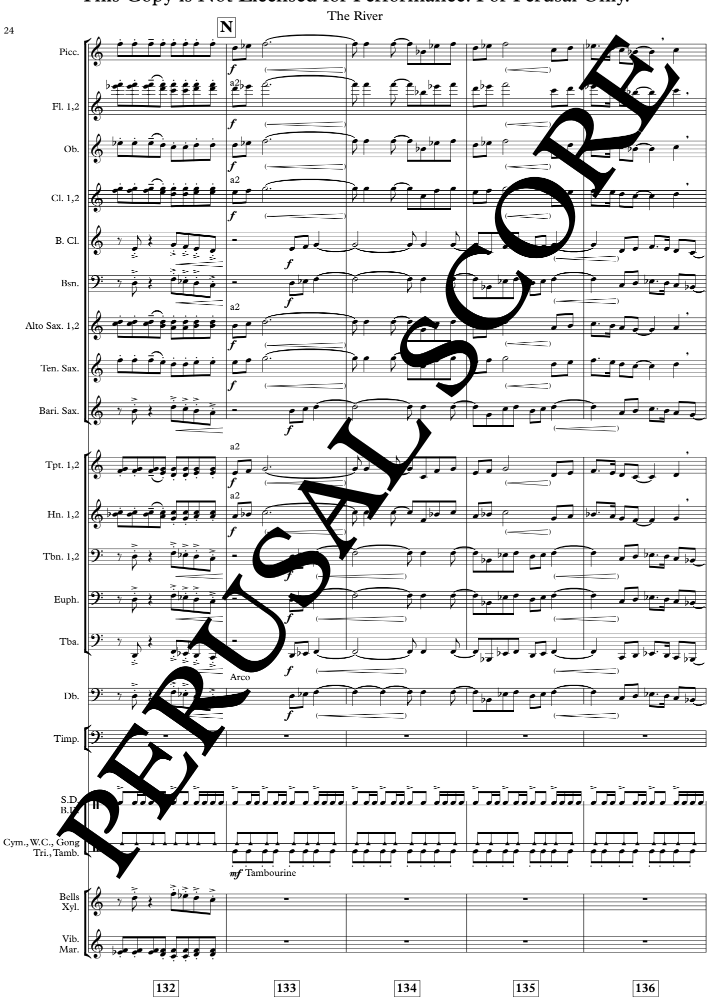
This Copy is Not Licensed for Performance. For Perusal Only.