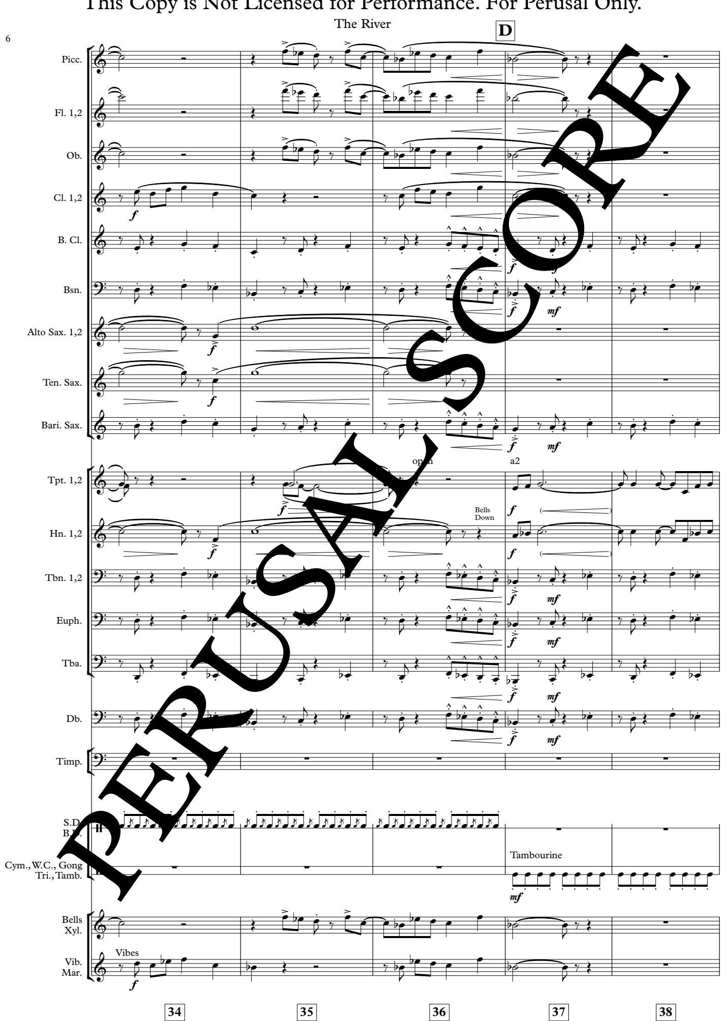
This Copy is Not Licensed for Performance. For Perusal Only.