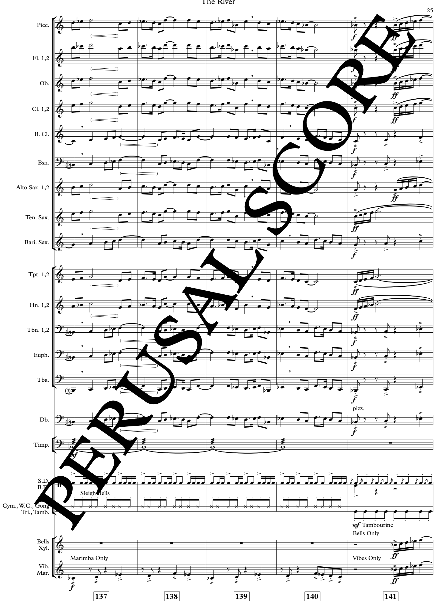
This Copy is Not Licensed for Performance. For Perusal Only. The River