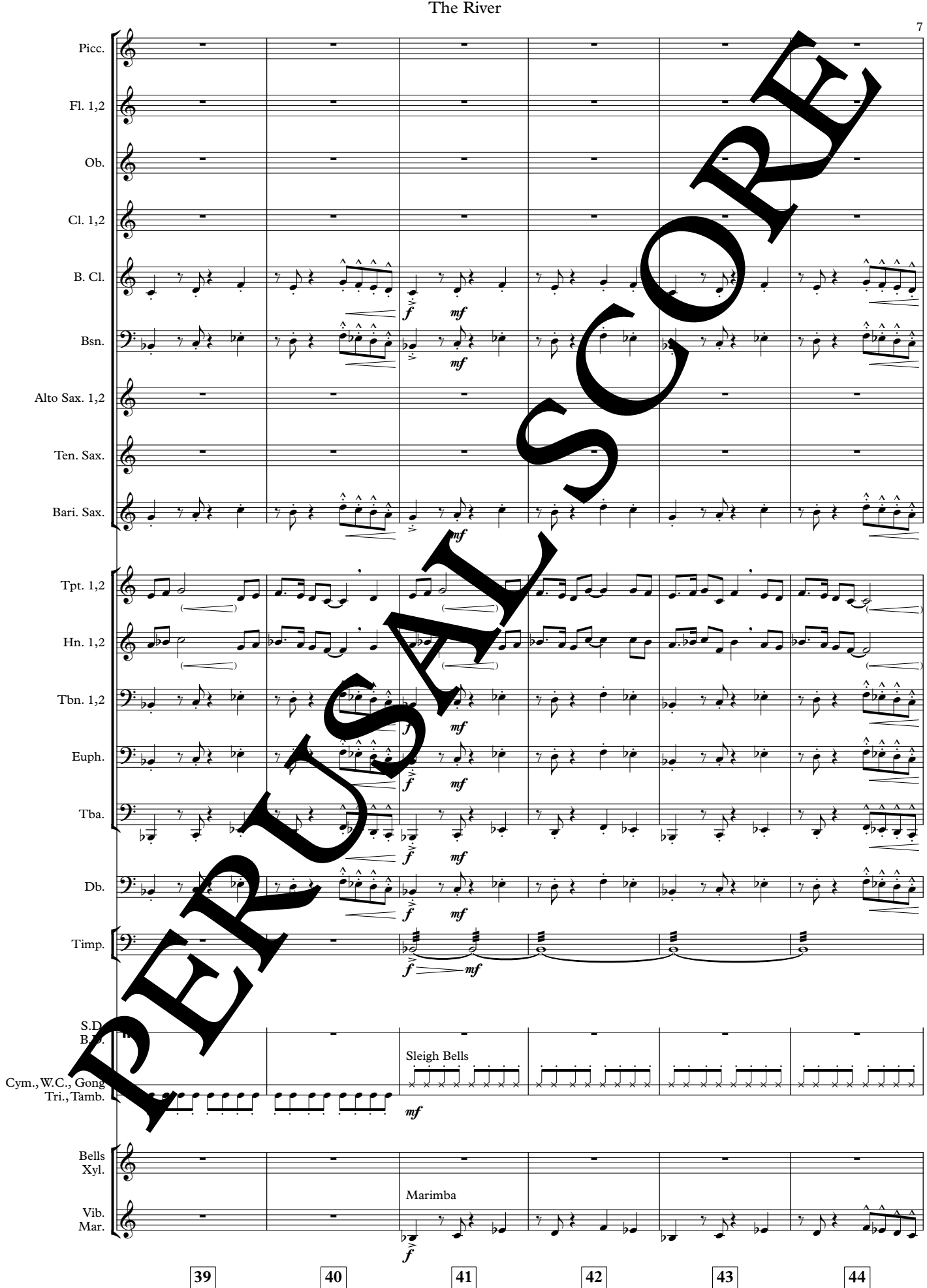
This Copy is Not Licensed for Performance. For Perusal Only. The River