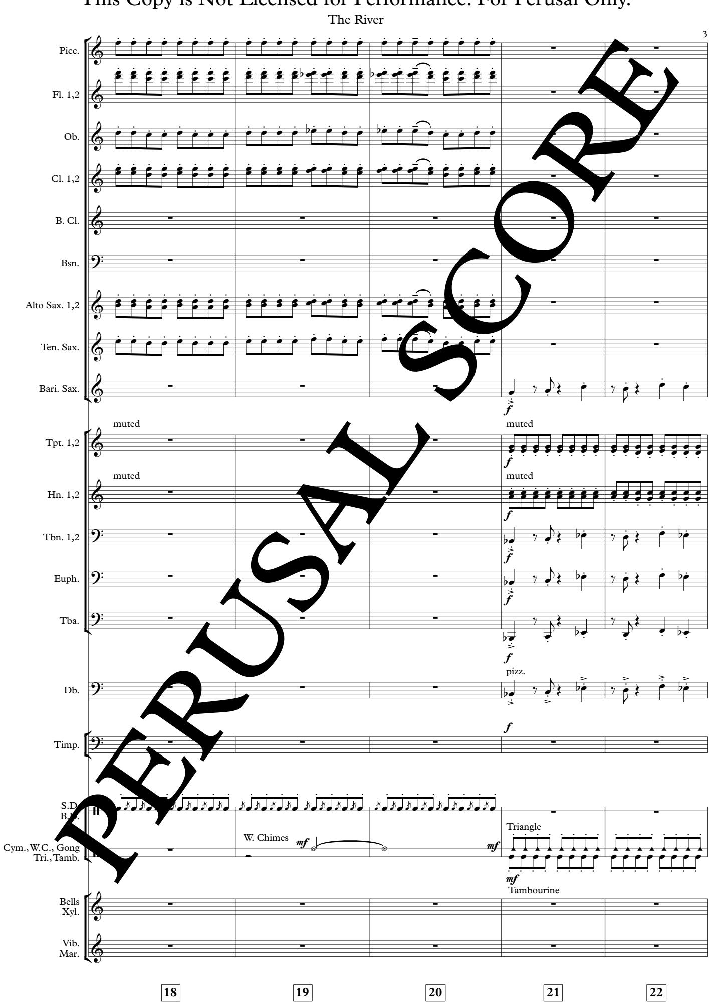
This Copy is Not Licensed for Performance. For Perusal Only.