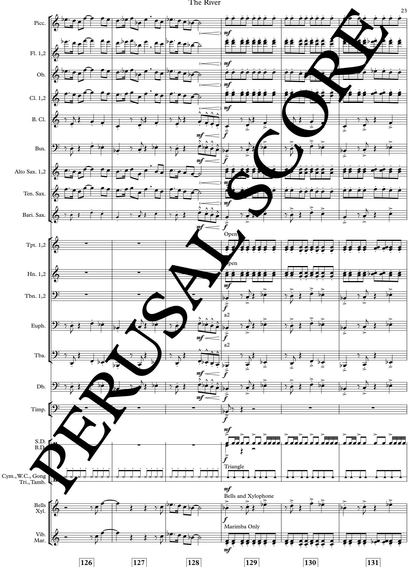
This Copy is Not Licensed for Performance. For Perusal Only. The River