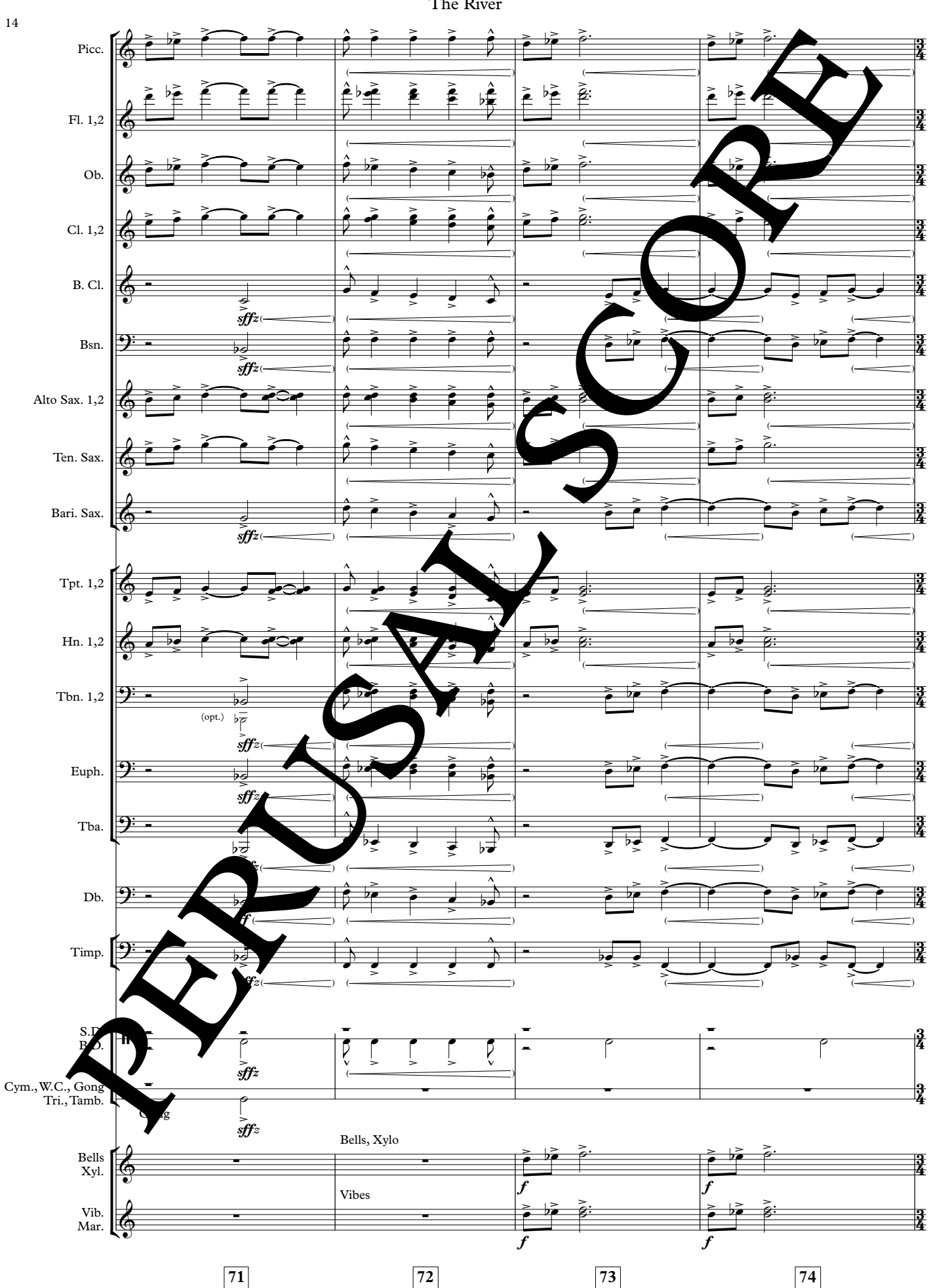
This Copy is Not Licensed for Performance. For Perusal Only. The River